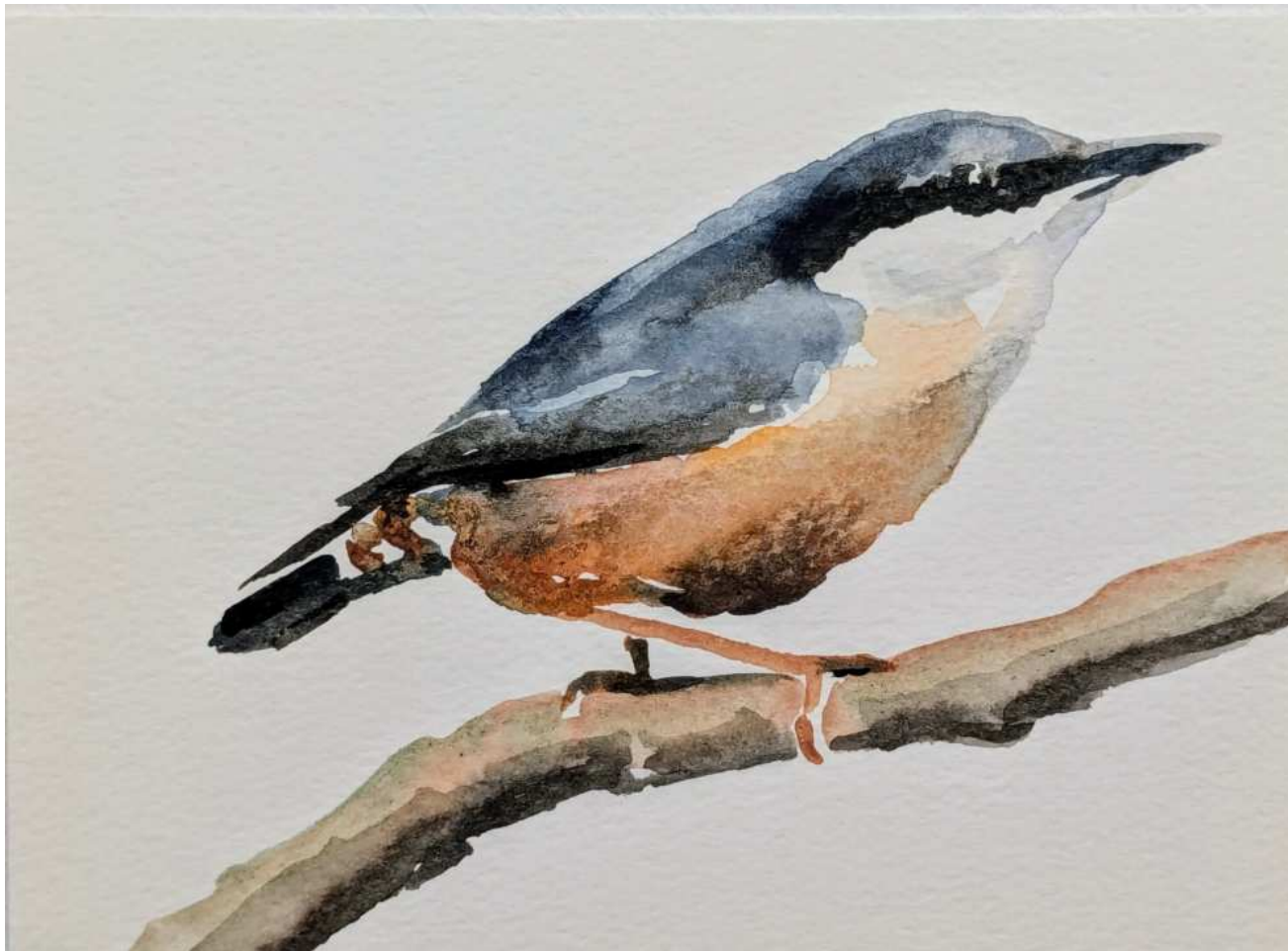
Liam Spencer - Nuthatch Watercolour on paper Framed and mounted Paper size 18 x 13cm SOLD ●