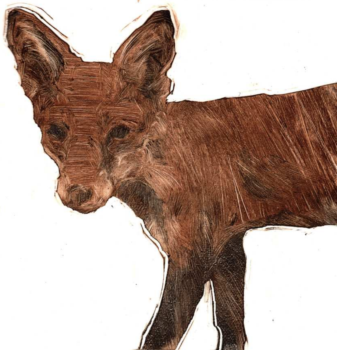
Emerson Mayes - Sauntering Fox Monotype on Fabriano Rosapina 285g, Edition of 1, 17 x 17cm