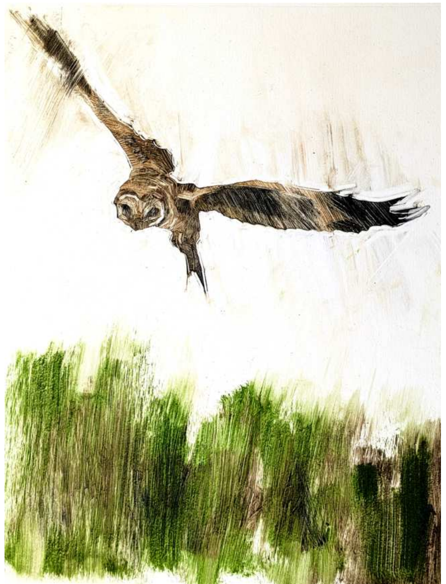
Emerson Mayes – Quartering Owl Monotype on Fabriano Rosapina 285g, Edition of 1 26 x 41cm £575