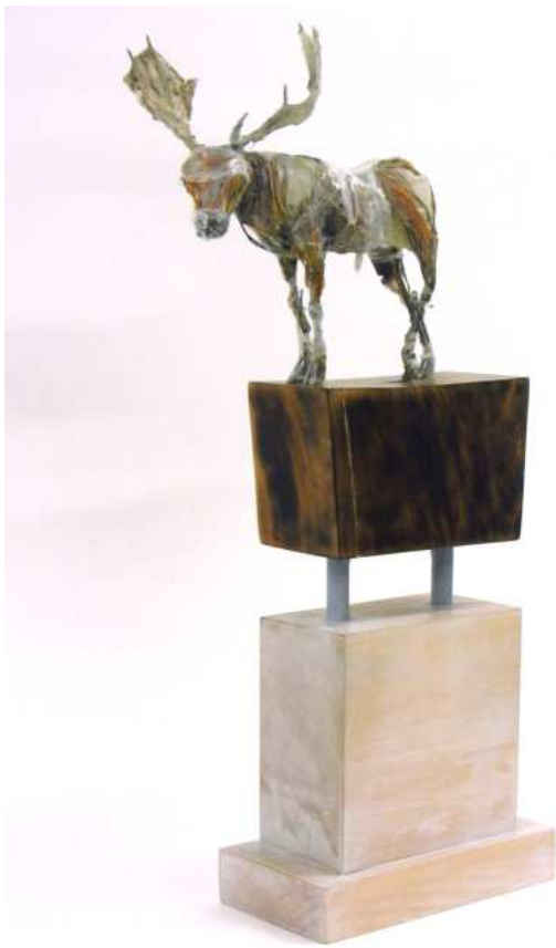
Mark Gibbs - Remembering The Future Mixed media 50 x 28 x 23cm £1300