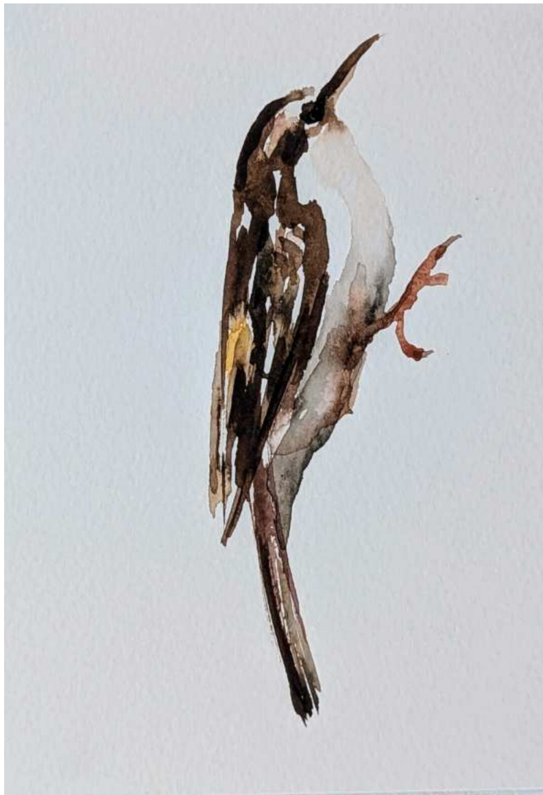
Liam Spencer - Tree Creeper Watercolour on paper Framed and mounted Paper size 13 x 18cm £275