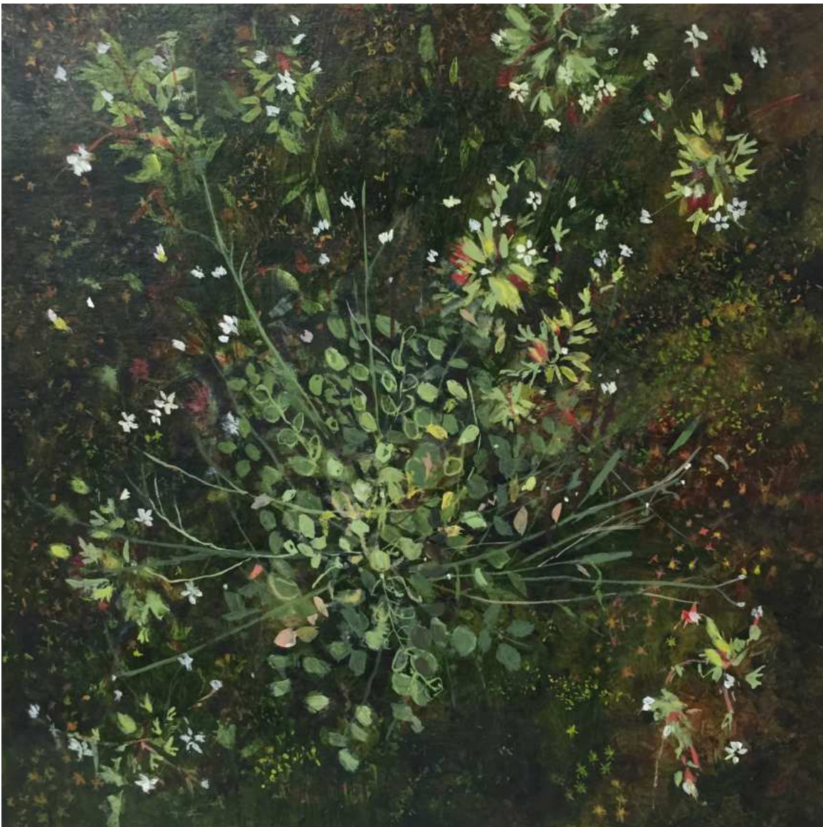
Helen Thomas – Bittercress and Rue Leaved Saxifrage Acrylic on paper Image size 20 x 20cm Framed size 39 x 39cm £500