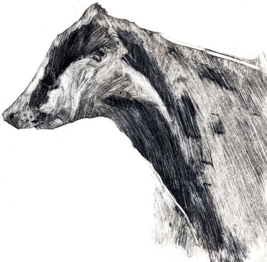
Emerson Mayes – Badger Headstudy Monotype on Fabriano Rosapina 285g, Edition of 1 17 x 17cm £375