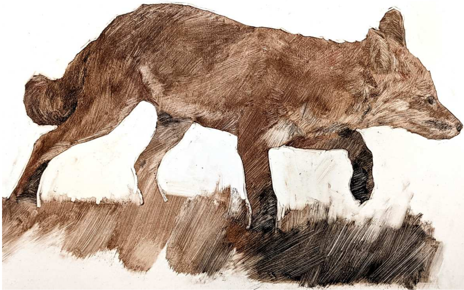
Emerson Mayes - Watchful Vixen Monotype on Fabriano Rosapina 285g, Edition of 1 26 x 41cm SOLD ●