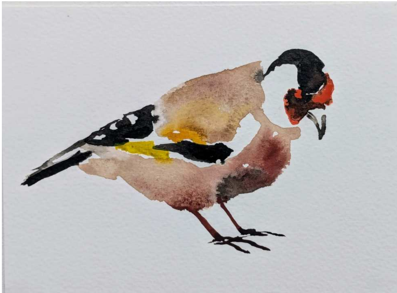
Liam Spencer - Goldfinch Watercolour on paper Framed and mounted Paper size 18 x 13cm SOLD ●