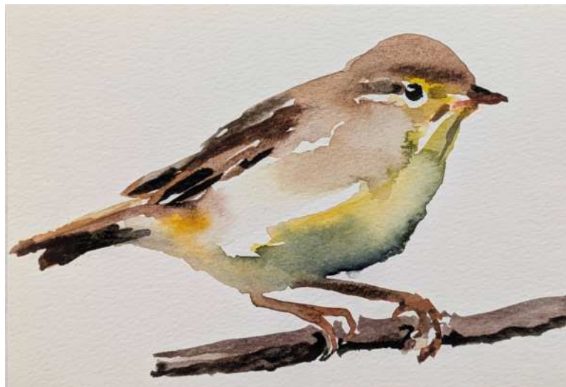
Liam Spencer Song Thrush Willow Warbler Weasel

Watercolour on paper Mounted, unframed Paper size 18 x 13cm Each £225