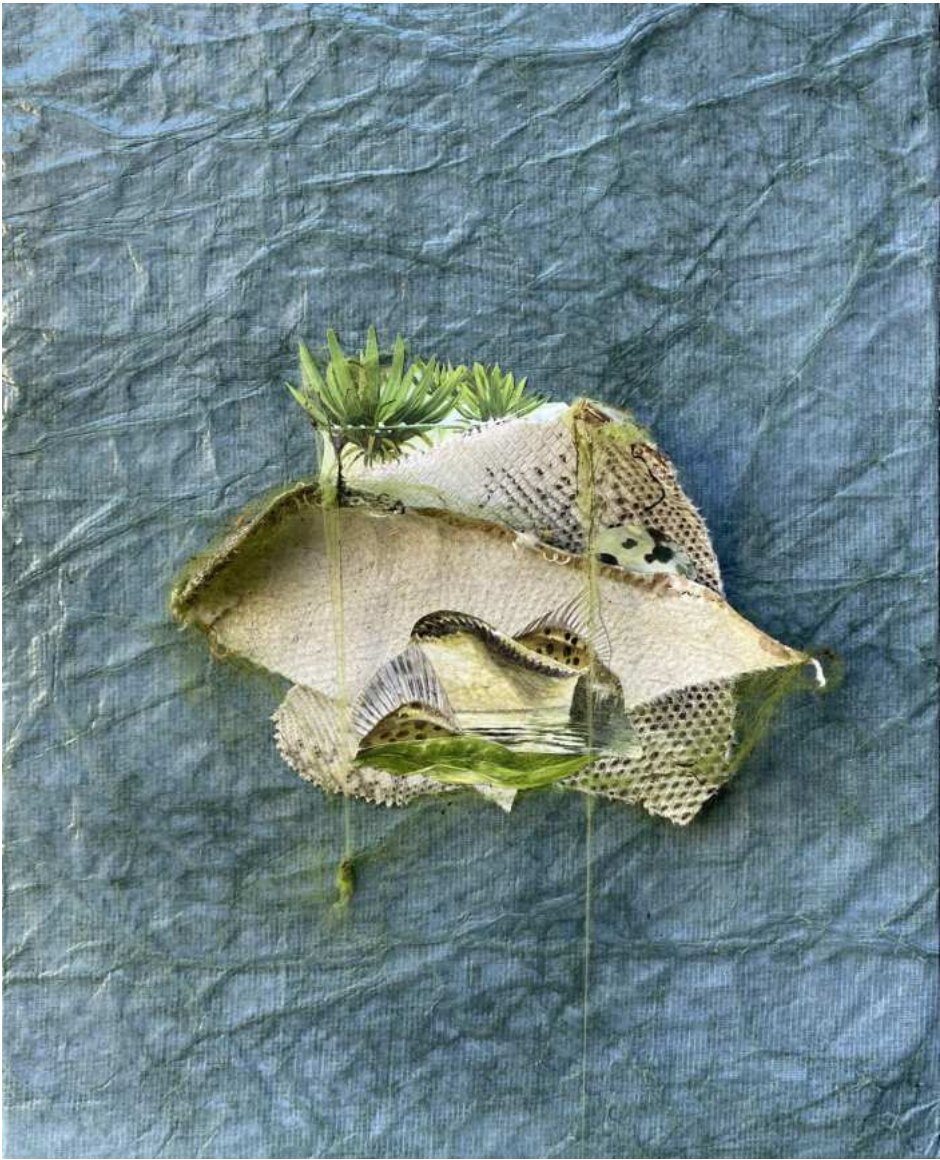
Ruby Tingle - Swamp Heaven Scene 2023 Collage, specialist paper, dye, fabric, reptile skin, board 26 x 20 x 2cm £300