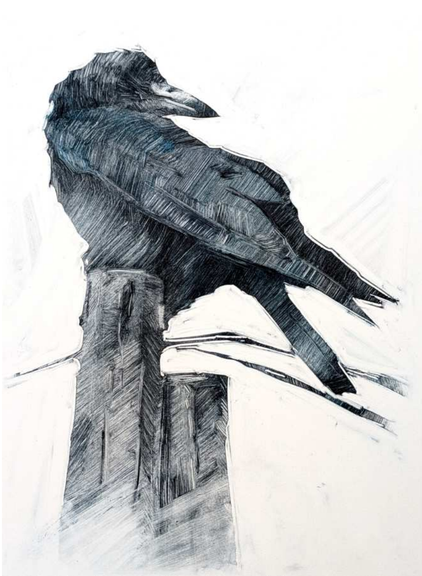
Emerson Mayes - Sentry Duty VI Monotype on Fabriano Rosapina 285g, Edition of 1 24 x 31cm £575