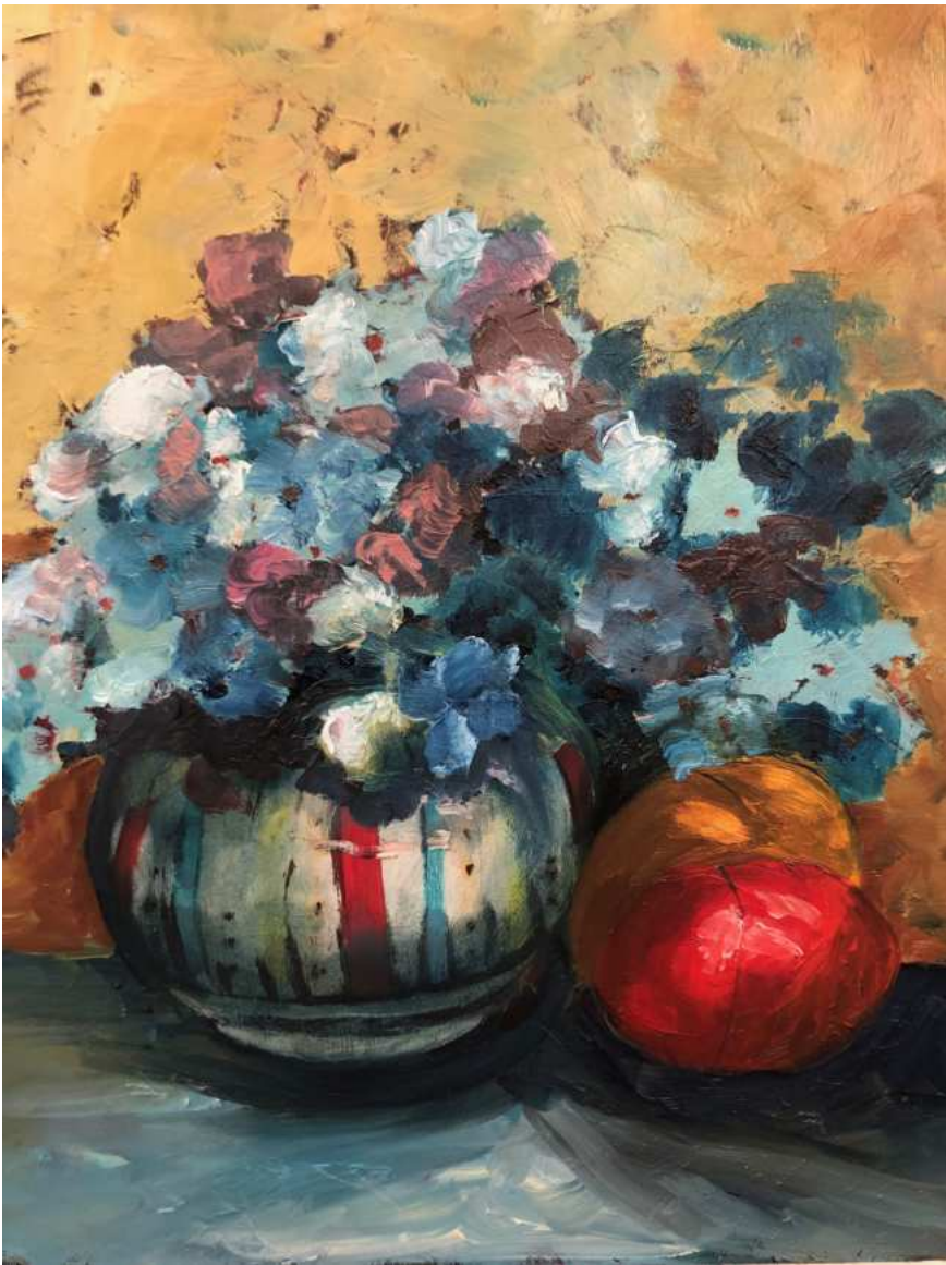
Jane Fairhurst - Hortensia in a Moroccan Vase with Two Wooden Eggs Oil on Lime wood board 25 x 30cm £950