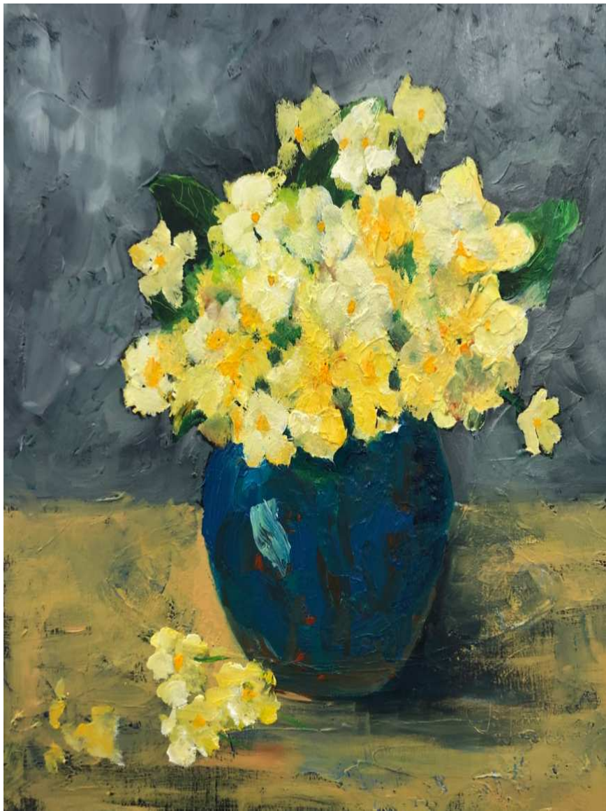
Jane Fairhurst - Primroses Oil on Lime wood board 25 x 30cm £950