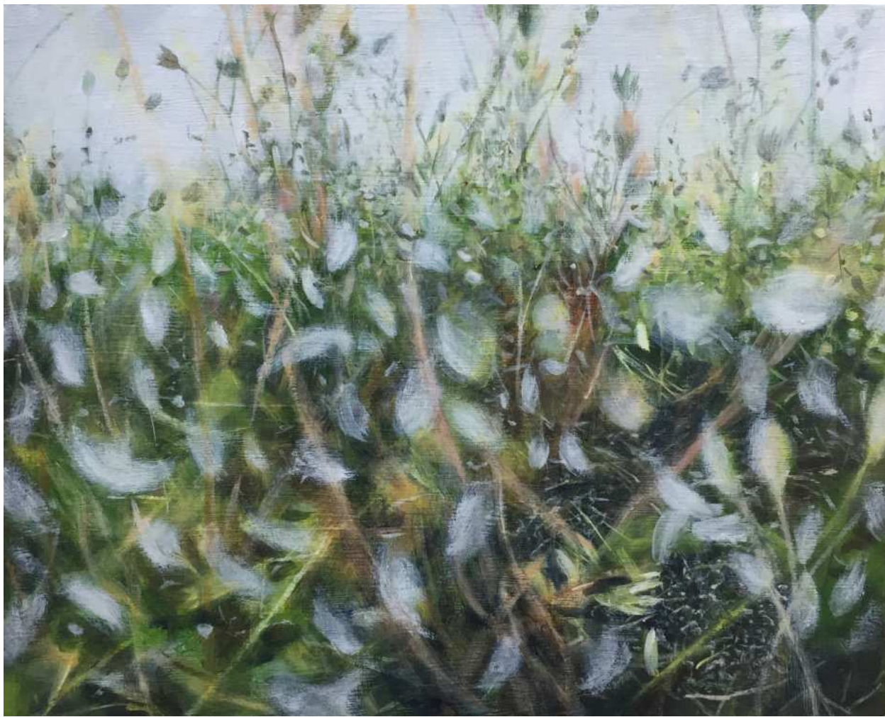
Helen Thomas – Common Whitlow Grass Corner of George and Smyth Street II Acrylic on cradled board 20.3 x 25.3 x 2cm £450