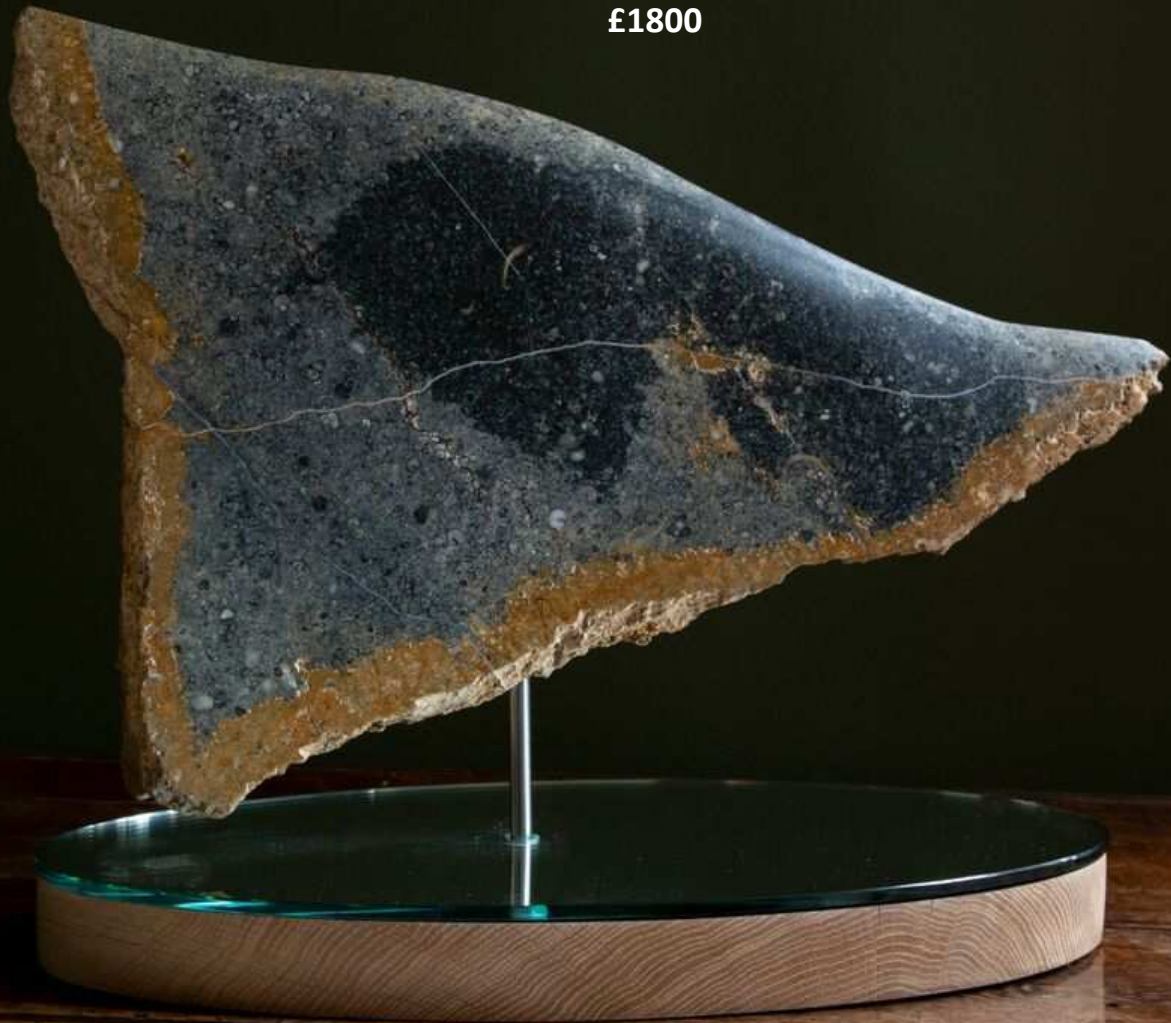
Steve Williams - Tropical Fish Purbeck marble 2023 42x55x25cm £1800