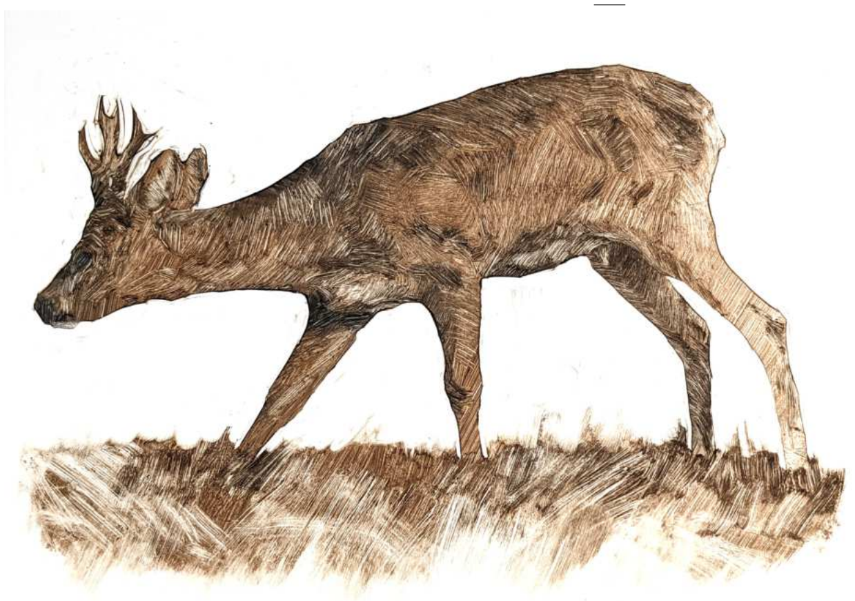
Emerson Mayes – Curious Roebuck Monotype on Fabriano Rosapina 285g, Edition of 1 21 x 29cm £545