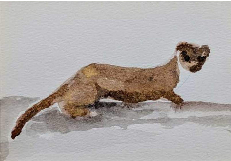
Liam Spencer Wood Mouse Shrew Weasel

Watercolour on paper Mounted, unframed Paper size 18 x 13cm Each £225