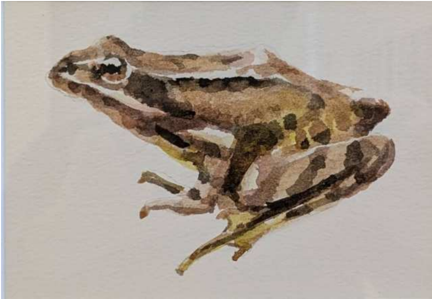
Liam Spencer Frog

Watercolour on paper Mounted, unframed Paper size 18 x 13cm Each £225