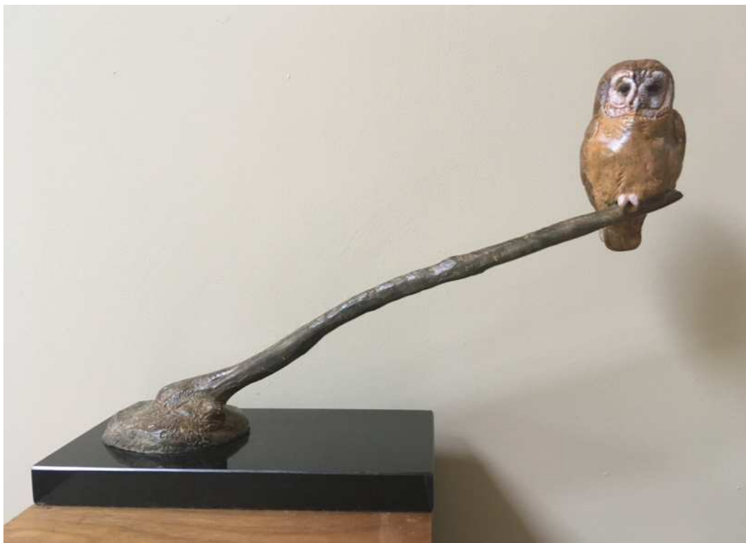
David Cemmick - Little Tawny Owl Limited Edition Bronze. 22 x 33cm £1500

No. 1 of 9 sold. Other editions available. Please enquire