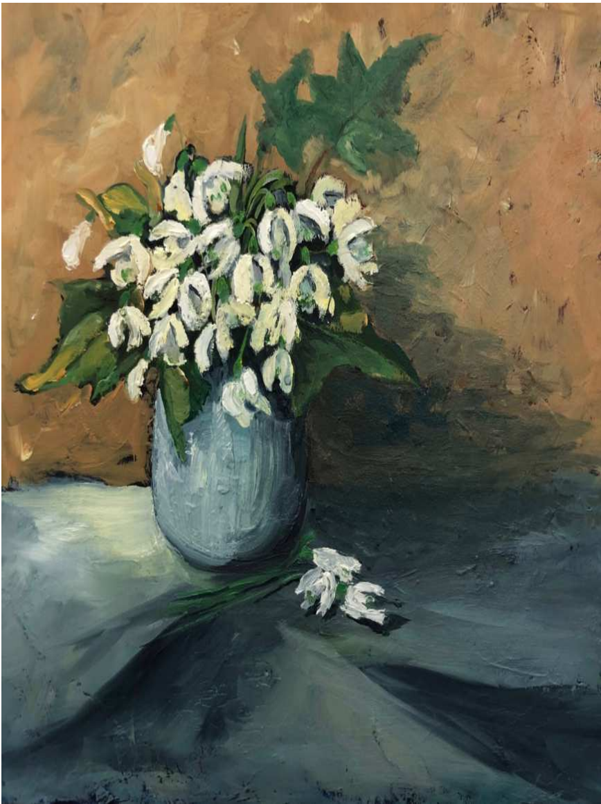
Jane Fairhurst - Snowdrops Oil on Lime wood board 25 x 30cm £950