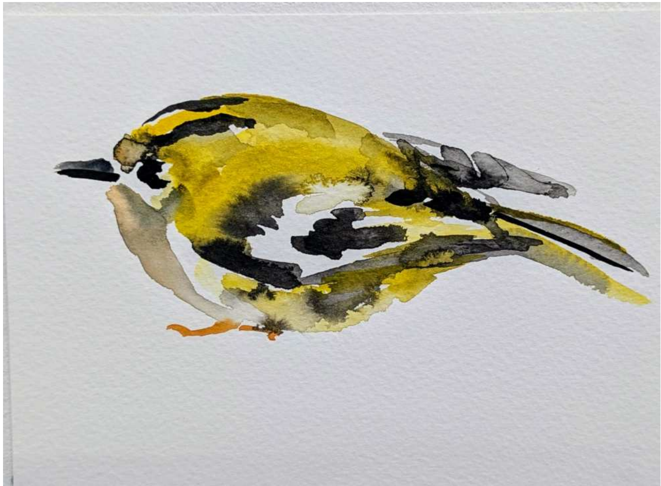
Liam Spencer - Goldcrest Watercolour on paper Framed and mounted Paper size 18 x 13cm SOLD ●