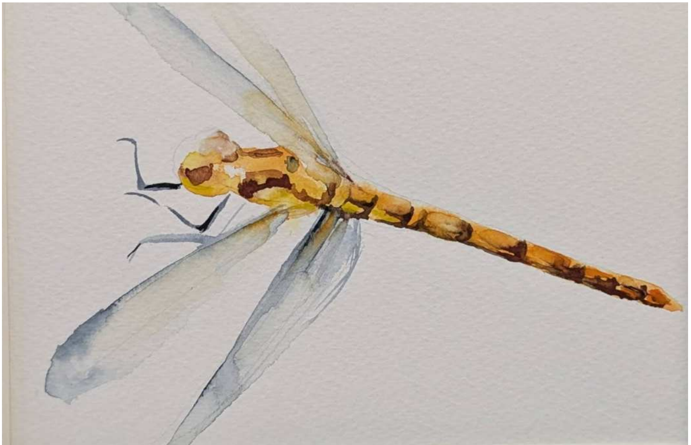
Liam Spencer - Common Darter Watercolour on paper Framed and mounted Paper size 18 x 13cm £275