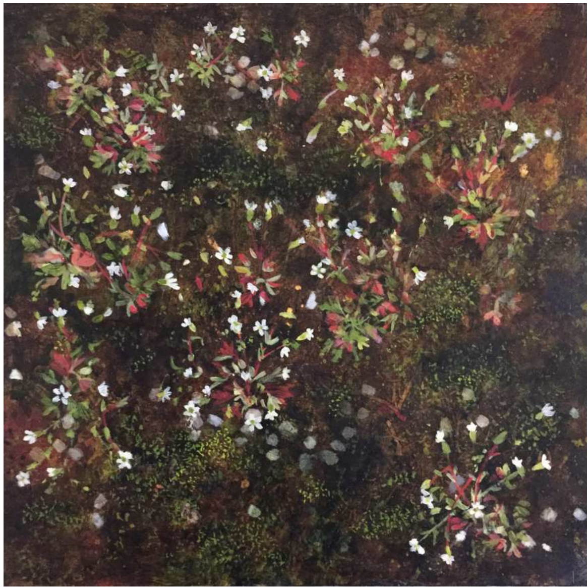
Helen Thomas – Rue Leaved Saxifrage Acrylic on paper Image size 20 x 20cm Framed size 39 x 39cm £500