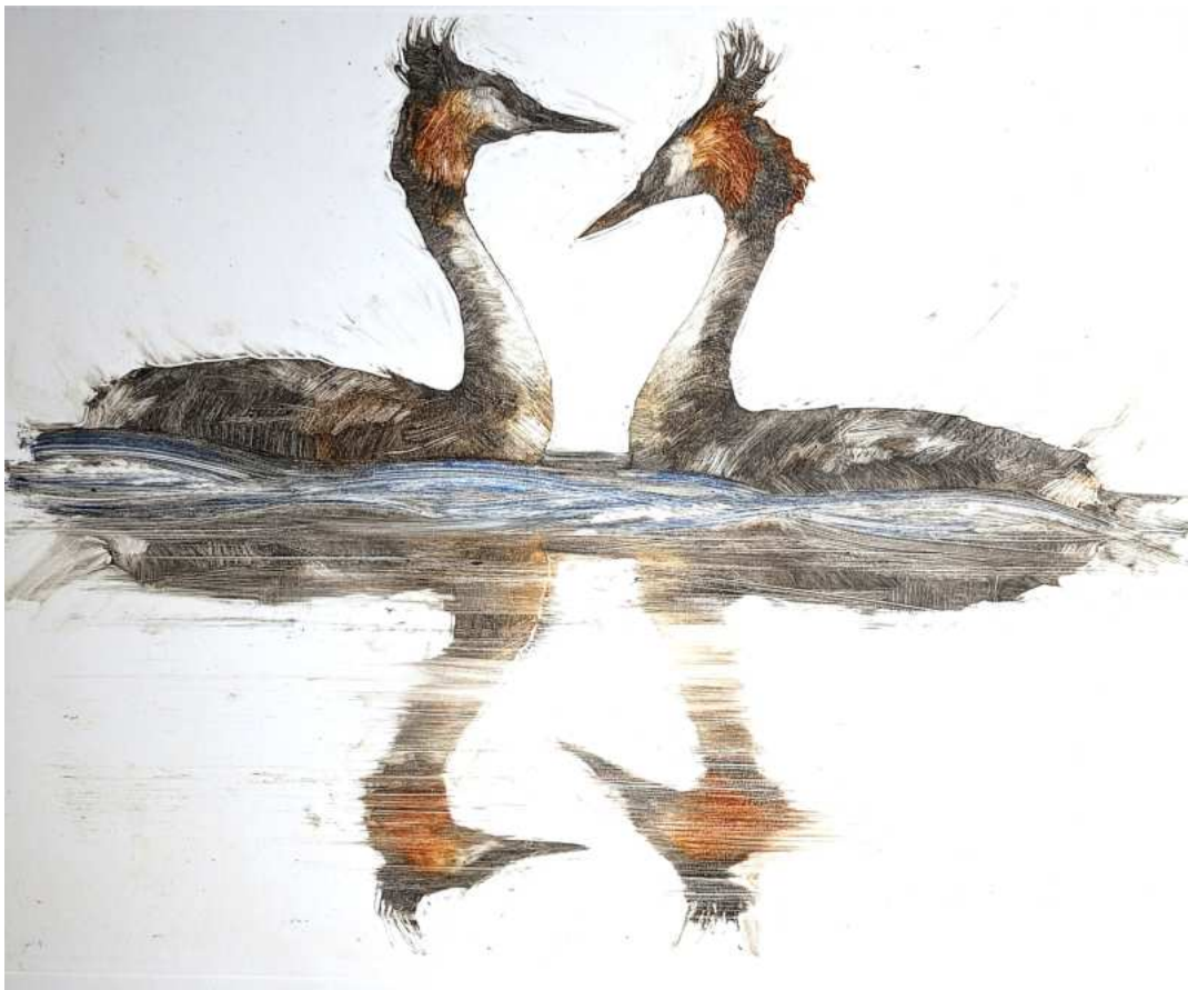
Emerson Mayes – Courting Grebes Monotype on Fabriano Rosapina 285g, Edition of 1 53 x 41cm £875