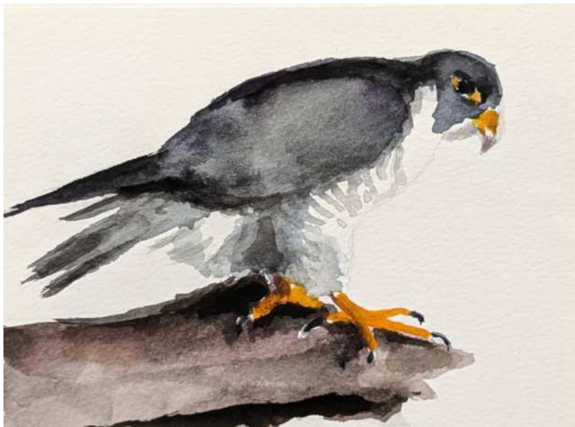
Liam Spencer Peregrine Falcon Sparrow Hawk

Watercolour on paper Mounted, unframed Paper size 18 x 13cm Each £225