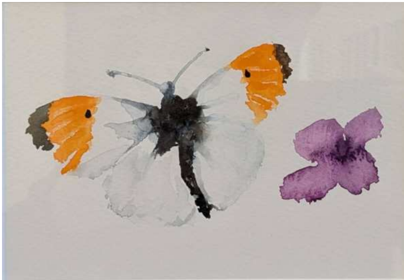
Liam Spencer Stone Chat Leaping Deer Orange Tip Butterfly

Watercolour on paper Mounted, unframed Paper size 18 x 13cm Each £225