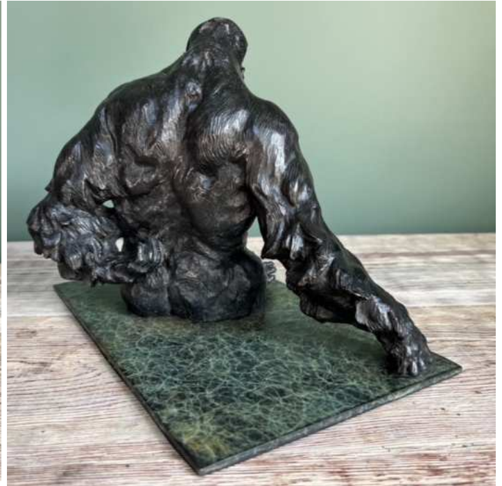
David Cemmick - Itch - seated gorilla Limited Edition Bronze. No. 3 of 9 22 x 28cm £2750