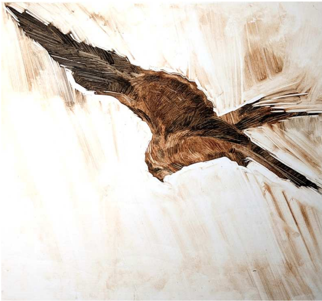
Emerson Mayes – Hovering Kestrel II Monotype on Fabriano Rosapina 285g, Edition of 1 29 x 27cm £575