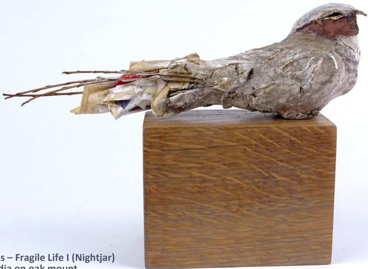
Mark Gibbs – Fragile Life I (Nightjar) Mixed media on oak mount 50 x 20cm Can be free-standing or wall mounted £1100