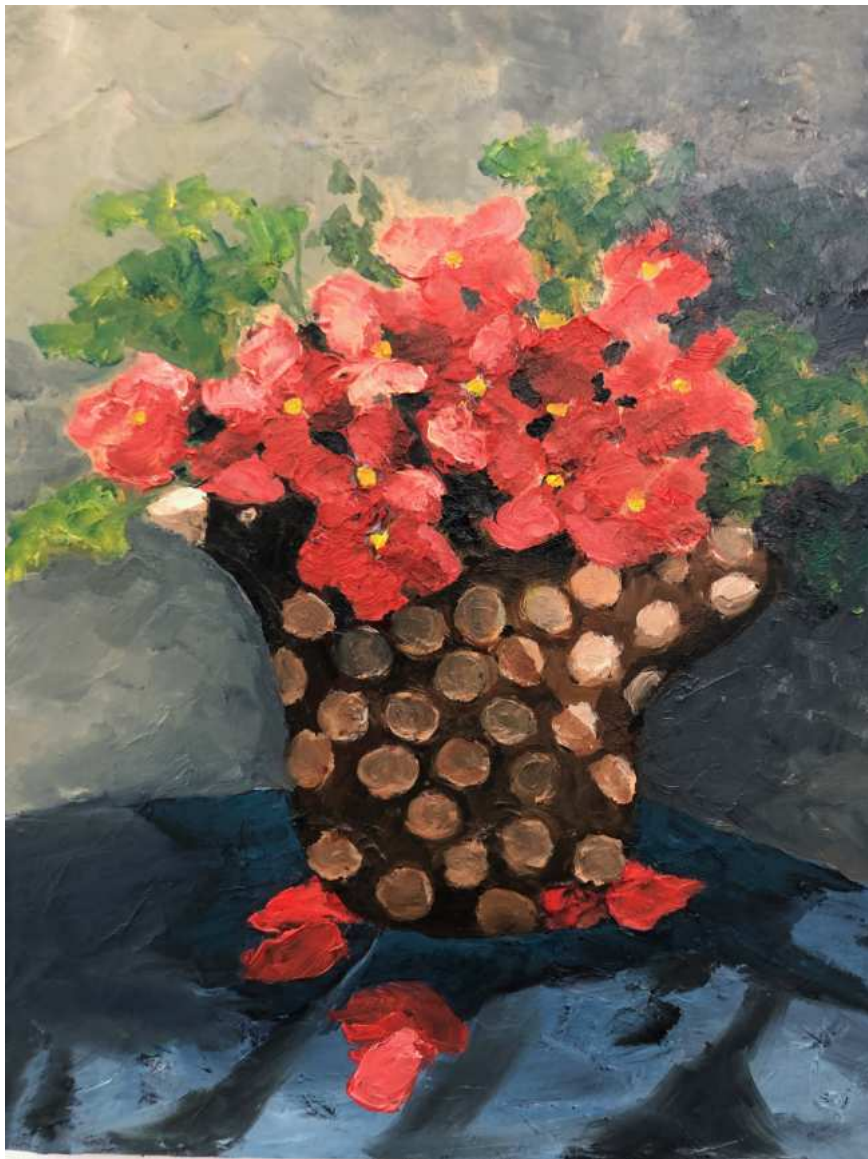
Jane Fairhurst - Geraniums in a Polka Dot Vase Oil on Lime wood board 25 x 30cm £950