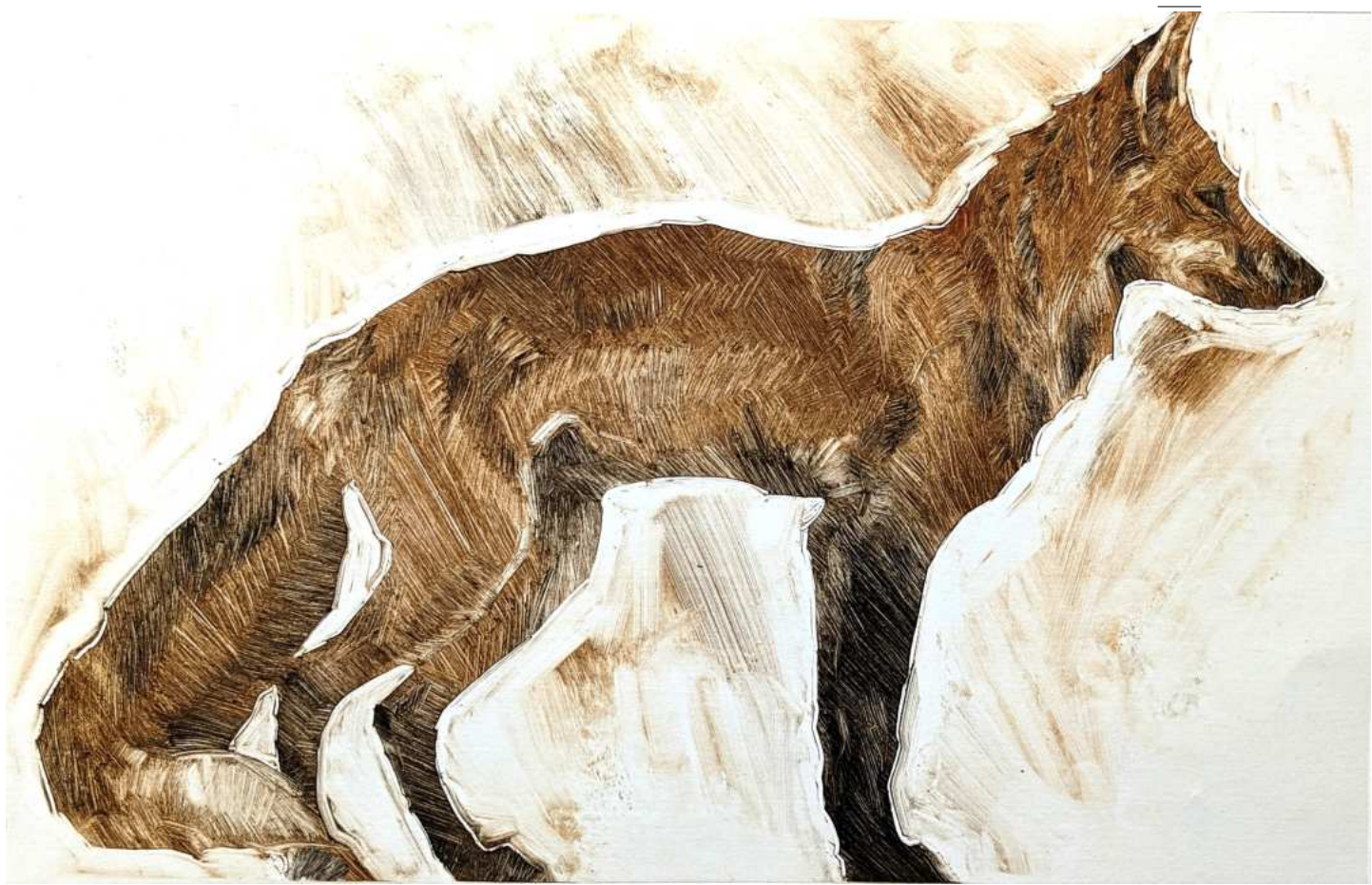
Emerson Mayes – Hovering Kestrel II Monotype on Fabriano Rosapina 285g, Edition of 1 26 x 41cm £625