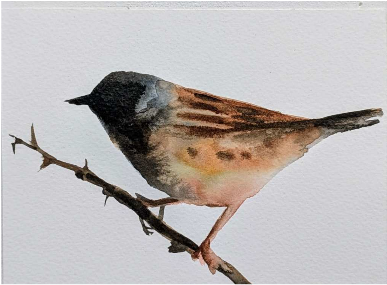
Liam Spencer - Dunnock Watercolour on paper Framed and mounted Paper size 18 x 13cm £275