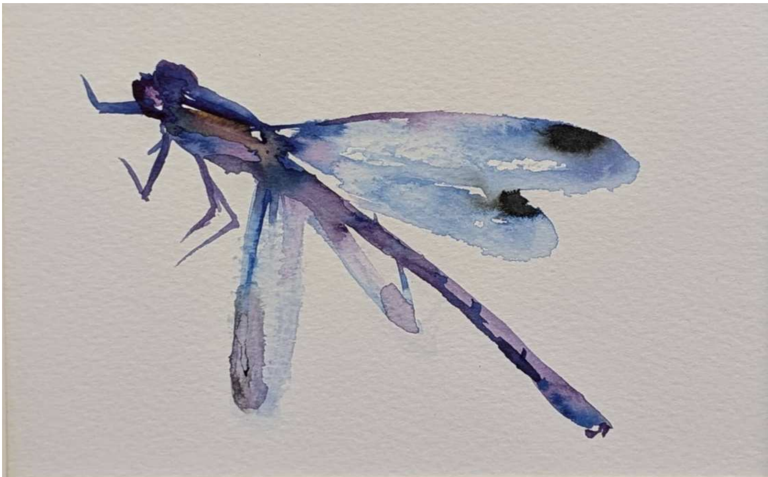
Liam Spencer - Damselfly Watercolour on paper Framed and mounted Paper size 18 x 13cm SOLD ●